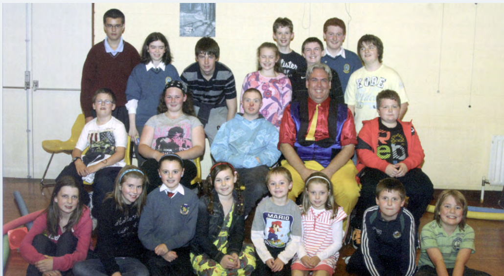
Children of the Parish enjoying the 40th Anniversary Celebrations

December: Launch of Parish Magazine, telling some of our parish story from the times before the church was built until the present.